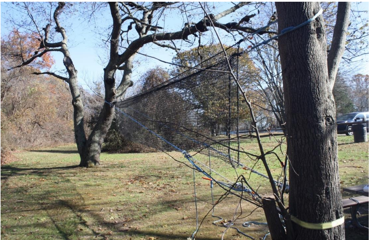
Fig. 1. A rapidly deployed suspended footbridge

The deployment method improvements described in this paper include augmenting the drone visuals during the flight, designing the bridge's components to accommodate various spans, and increasing the deck's stiffness. Incorporating a second drone equipped with a video camera into the deployment provides the drone operators with a larger field of view and multiple vantage points to utilize during flight. Accommodating various spans can be done by examining the adjustability the bridge already has from its variable-length components. Increasing the stiffness of the deck in order to make the bridge easier to walk on without significantly increasing the weight of the structure and/or the deployment time can be achieved by adding a semirigid inlay. These improvements have the potential to enhance the versatility of rapidly deploying suspended footbridges in a range of environments.